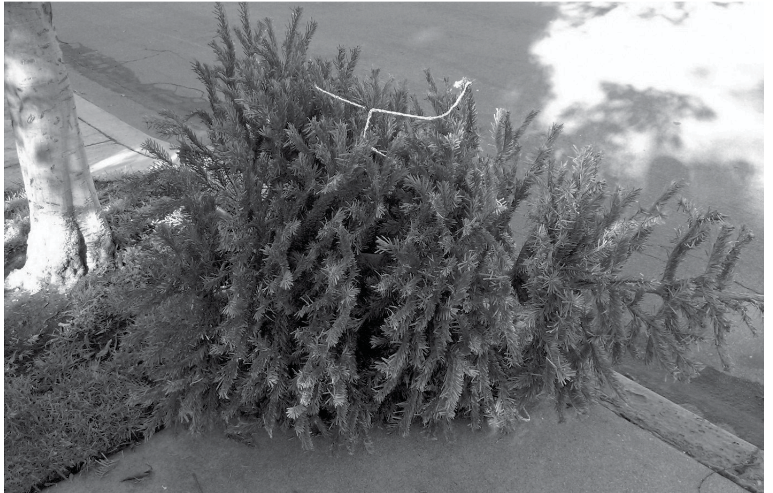
The City will offer curbside collection for Christmas trees until Friday, Jan. 11. Residents are asked to remove all ornaments, decorations, tinsels, and stand from the tree. Collected Christmas trees will be recycled into compost and mulch.